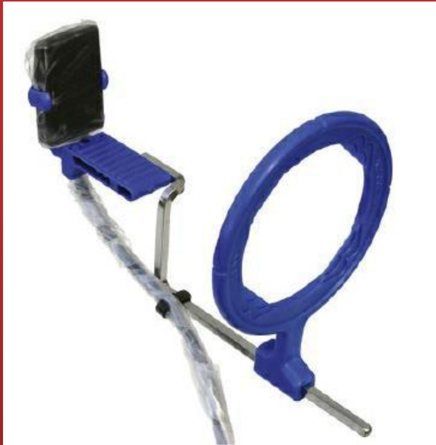
Film-holding instrument with barrier wrapping to protect sensor and cord from saliva.