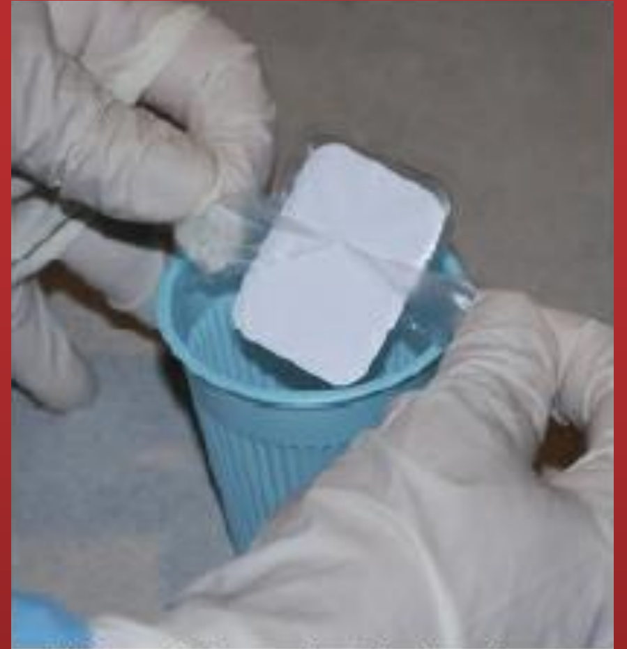
Dental film with a plastic barrier to protect film from contact with saliva. During opening, the plastic is removed and the clean film is allowed to drop into a container