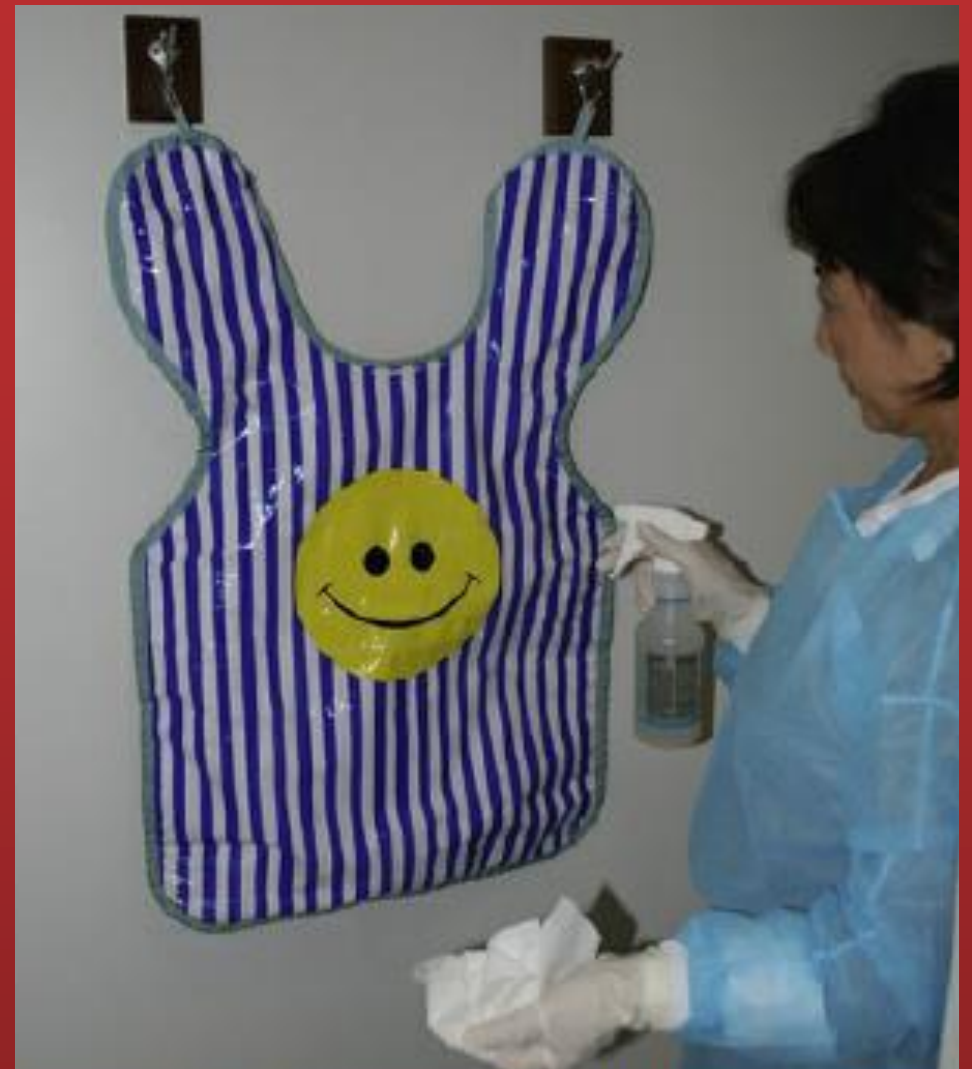
Hanging apron is sprayed with disinfectant and then dried and covered with a garment bag