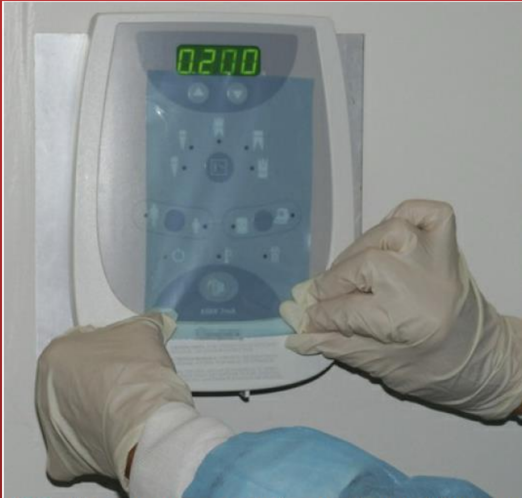
The exposure control console should be covered with a clean barrier and changed after every patient