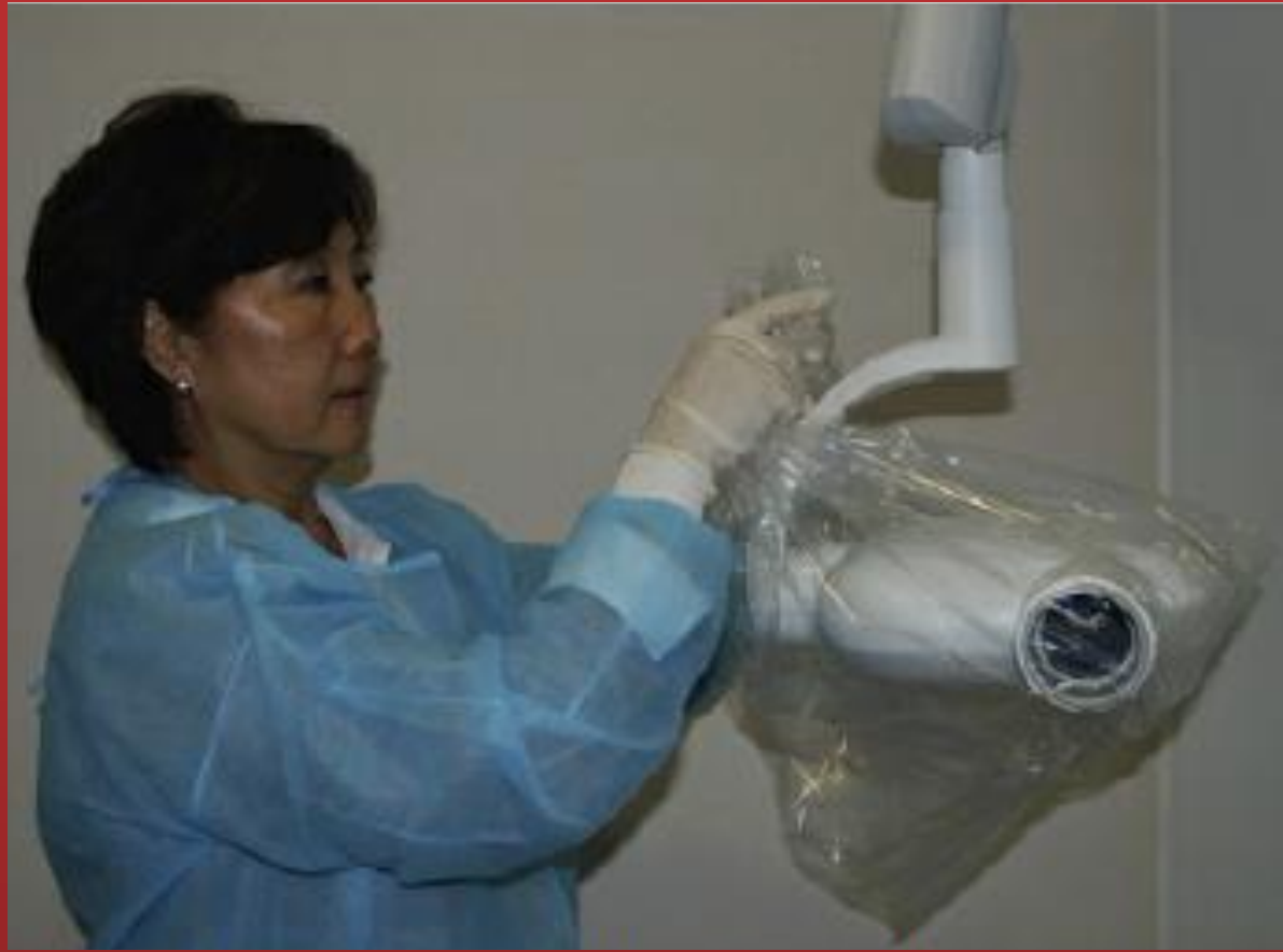
A Plastic bag is slipped over the x –ray tube head with a large rubber band just proximal to the swivel or tie ends, as shown here. The plastic is pulled tight over the position – indicating device (PID) and secured with a light rubber band slipped over the PID and placed next to the head