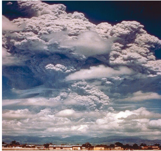
Figure 6 The first major eruption of Mt. Pinatubo on 12 June 1991. Mt. Pinatubo is located on the southwestern part of the island of Luzon in the Philippines. Prior to 1991, it had been dormant for more than 635 years.