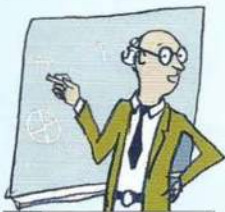
1 a teacher

a doctor a nurse a student a teacher a shop assistant a bus driver a businessman a police officer a builder