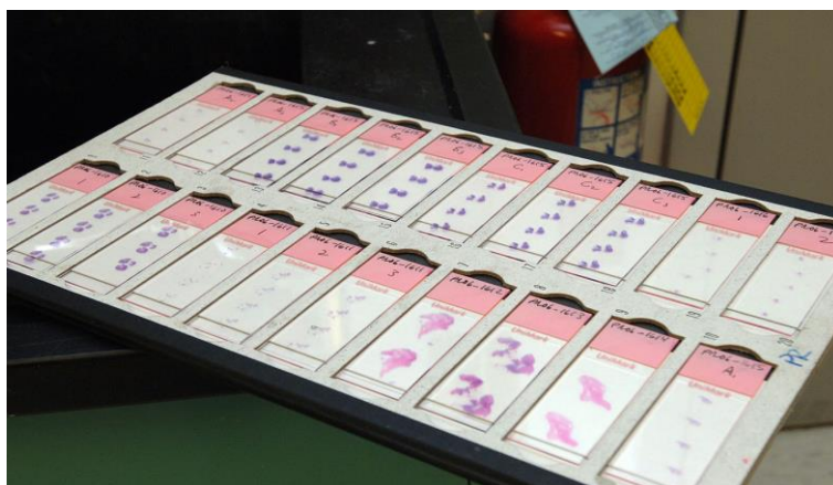
Microscope slides with prepared, stained, and labeled tissue specimens in a standard 20-slide folder.

Prepared permanent slides are valuable. They are widely used by educational establishments in the teaching of histology (the study of tissues of plants and animals) and cytology (the study of cells). In some cases the preparation may be uniquely valuable. It could for example be an important reference slide or a slide of the diseased tissues of a hospital patient.