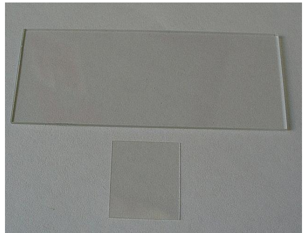
A microscope slide (top) and a cover slip (bottom)

The white area can be written on to label the slide.