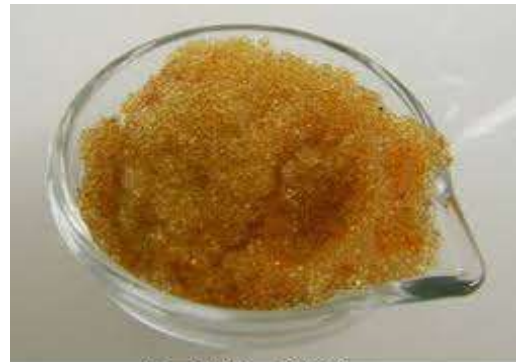
Ion Exchange Resin

\text{A}^{-n} \longrightarrow the negative ions in solution (or in salt ions)