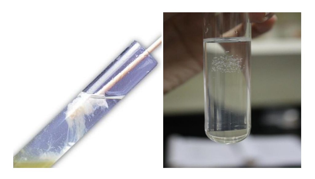
DNA rising from the bottom of the cup to the top.