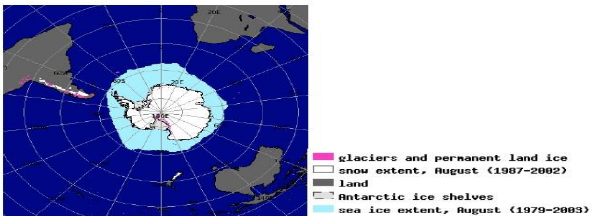
Figure 1.6: Location of sea ice, snow and land ice in August in the Southern Hemisphere.