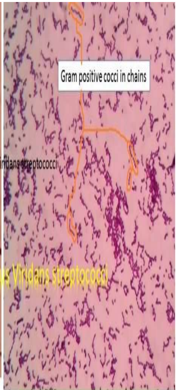
Streptococci in Gram stain stained smear