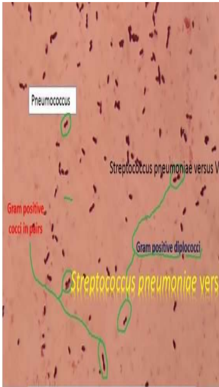
Streptococcus pneumoniae in Gram stain