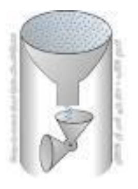
Inclined bucket device