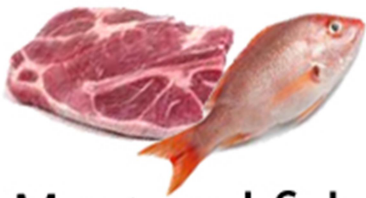
Meat and fish