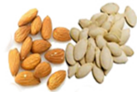
Nuts and seeds