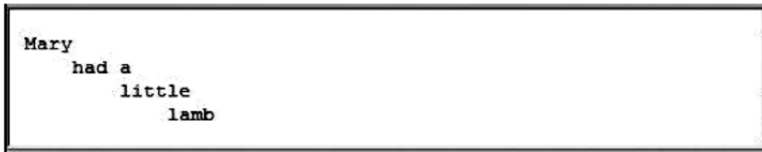
Figure 5 the pre element

A pre element can contain virtually any other tags, except those that cause a paragraph break, such as paragraph elements.