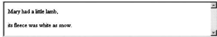
Figure 3 The paragraph element

<p> Mary had a little lamb, </p> <p> its fleece was white as snow. </p>