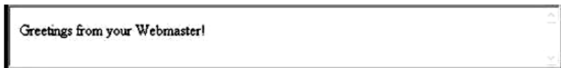
Figure 2 Display of greet.html

Figure 2 shows a browser display of greet.html.