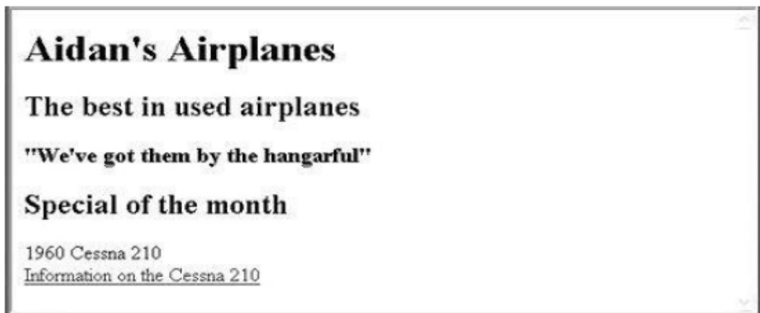
Figure 11 Display of link.html

In this case, the target is a complete document that is stored in the same directory as the XHTML document. Figure 11 shows a browser display of link.html. When the link shown in Figure 11 is clicked, the browser displays the screen shown in Figure 12 .