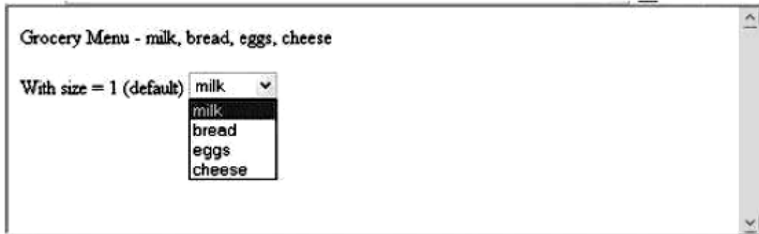
Figure 25 Display of menu.html after the scroll arrow is clicked