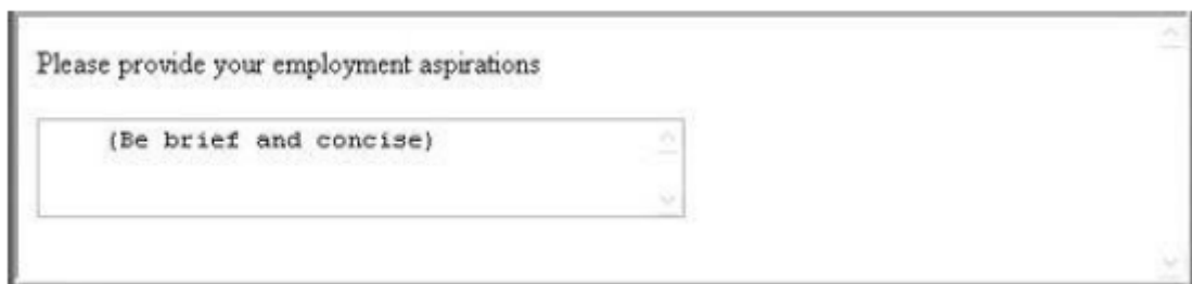
Figure 27 Display of textarea.html after some text entry

<?xml version = "1.0" encoding = "utf-8"?> <!DOCTYPE html PUBLIC "-//W3C//DTD XHTML 1.0 Strict//EN" "http://www.w3.org/TR/xhtml1/DTD/xhtml1-strict.dtd"> <!-- textarea.html An example to illustrate a textarea --> <html xmlns = "http://www.w3.org/1999/xhtml"> <head> <title> Textarea </title> </head> <body> <p> Please provide your employment aspirations </p> <form action = "handler"> <p> <textarea name = "aspirations" rows = "3" cols = "40"> (Be brief and concise) </textarea> </p> </form> </body> </html>